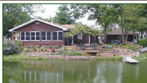
The resort is ¼ mile from Lake Shelbyville and Lithia Springs Marina 2077 E. 1500 N. Rd, Shelbyville, IL 62565

MOTEL ROOMS WITH KITCHENS AND CABIN RENTALS IN A SERENE SETTING